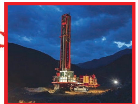
End application - rotary blasthole drilling rigs.

Denotes the parts of the component journey undertaken by Bodycote Background and end application images courtesy of Sandvik AB